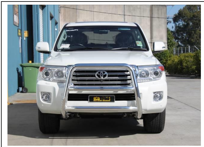
Figure 7: 63mm Series 2 Nudge Bar front view shown