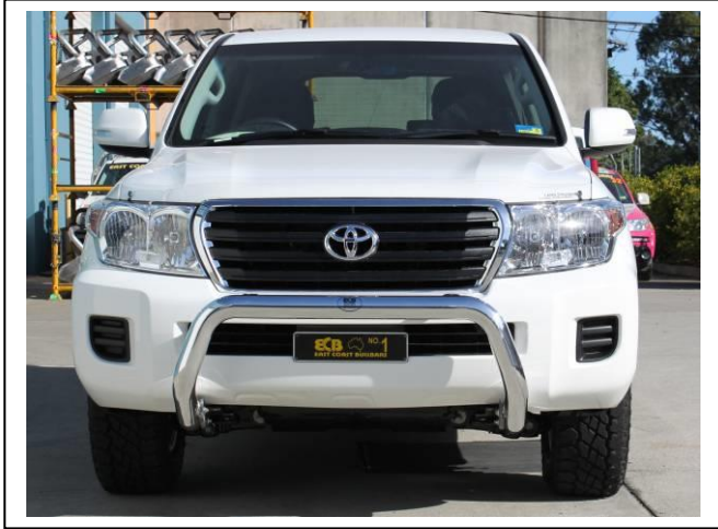
Figure 5: 76mm Nudge Bar front view shown